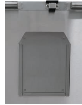
MODEL# BO-0204 Card Holder