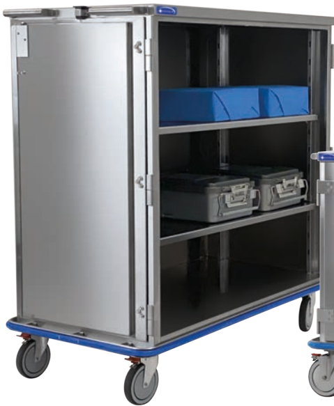
BOLTED CASE CARTS

Case Carts are abused daily, which can lead to damage. With Bolted (vs. welded) Construction , LogiQuip Case Carts are easily serviced to reduce downtime and extend the life of your Case Carts .