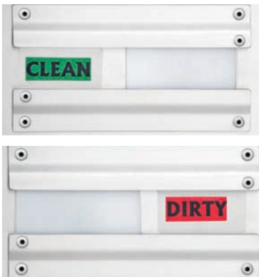
MODEL # OTR0100-01-KT Easy slide CLEAN/DIRTY Indicator eliminates guesswork and errors