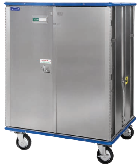
OVER-THE-ROAD CASE CART