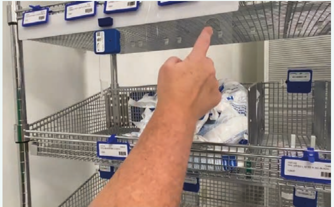
Wider lanes using the Kanban Sliding Door