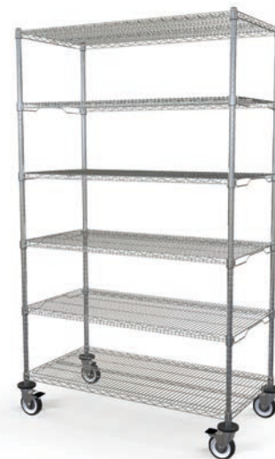
MODEL # MB466CWC-6