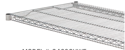
MODEL # 2460CHWF