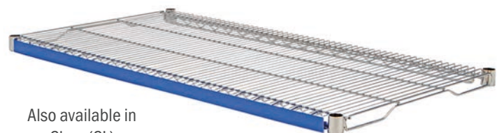
Also available in Clear (CL)