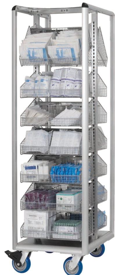
MODEL # LQDC18S