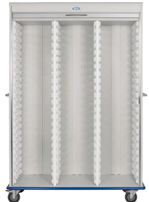
Model # 2653TTTGKL