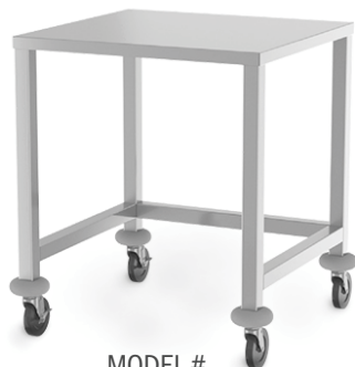
MODEL # PT3032U