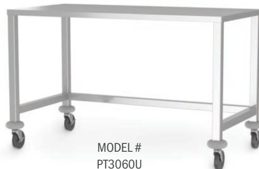
MODEL # PT3060U