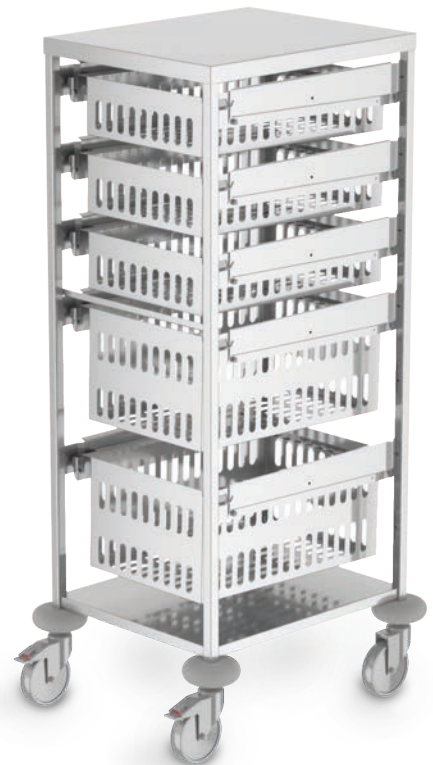
MODEL # 797PCT-32