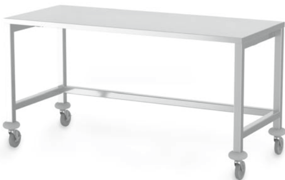
MODEL # PT3078U