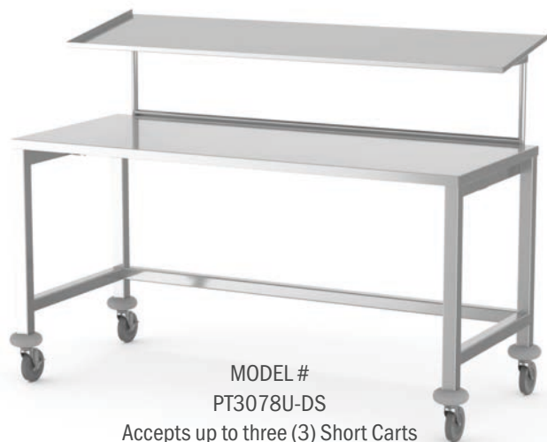
MODEL # PT3078U-DS