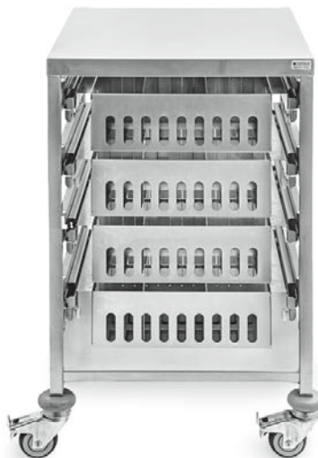
MODEL # 797PCS-4