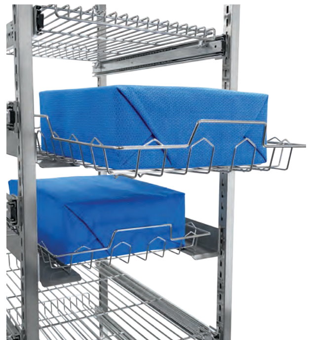
MODEL # SPOT3N

LogiQuip products are covered by a Limited 5-Year Warranty . Visit LogiQuip.com/Warranty for more details.