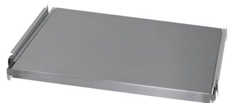
Roll-Out Solid Stainless Steel Shelf