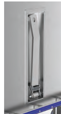
CC-TOW Tow Hitch System