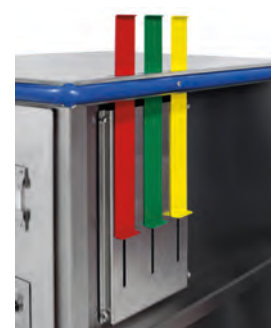
MODEL# CC-FLAG3 Flag System