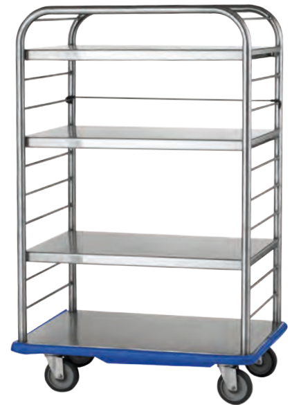
OPEN CASE CART (Available as Custom)