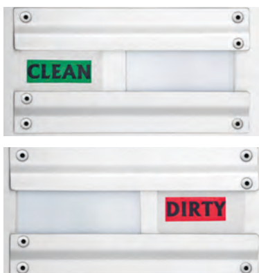
MODEL # OTR0100-01-KT Easy slide CLEAN/DIRTY Indicator eliminates guesswork and errors