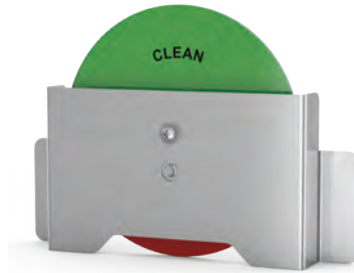
MODEL# CC0230-01-BIO CLEAN/DIRTY Indicator Wheel