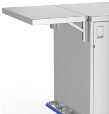
MODEL# CC-TSE Extension Drop Shelf