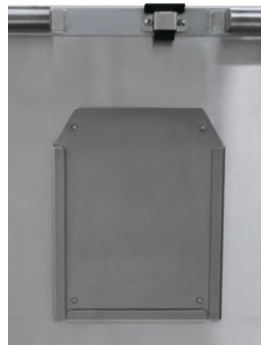
MODEL# BO-0204 Card Holder