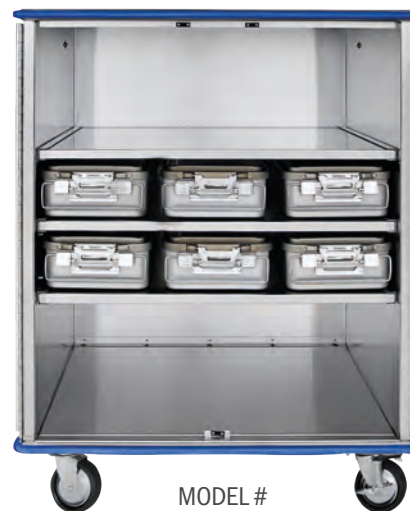
MODEL # OTRCC3657SS