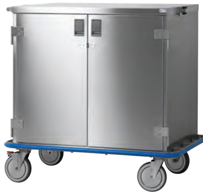
BOLTED CASE CART