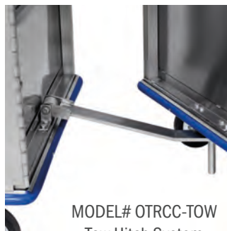
MODEL# OTRCC-TOW Tow Hitch System