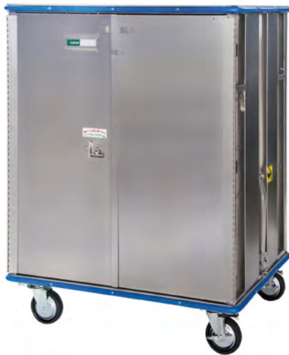
OVER THE ROAD CASE CART

Case Carts are abused daily, which can lead to damage. With Bolted (vs. welded) Construction , LogiQuip Case Carts are easily serviced to reduce downtime and extend the life of your Case Carts .