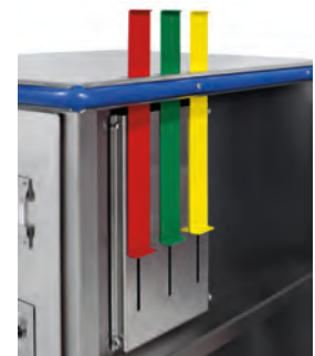
MODEL# CC-FLAG3 Flag System