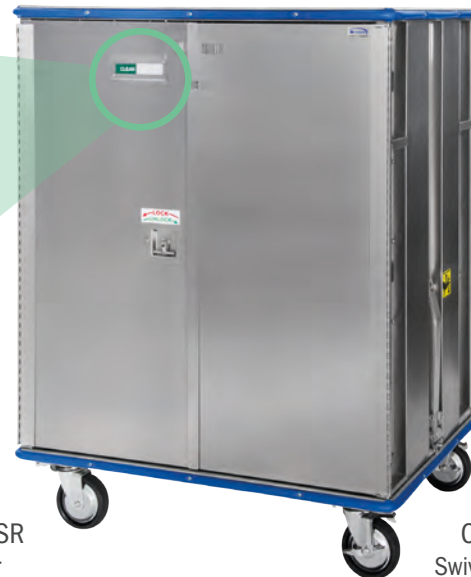
MODEL# CW31-76RCSR Rigid Caster