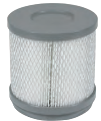
MODEL # 40000MFF