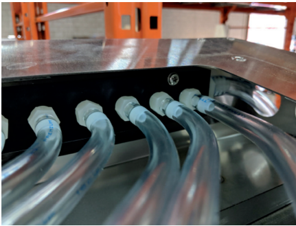
Large Barb Manifold