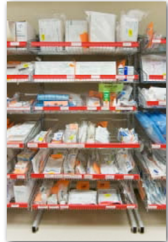
Par Wall® for clean, accessible storage

Both PAR WALL® and PAR STOR®-III can be easily and inexpensively configured to enable a Kanban type Lean replenishment system. Both are highly configurable to accommodate many different SKU PAR levels and sizes. Using PAR WALL® and PAR STOR®-III in patient floor inventory locations provides an excellent opportunity for utilizing a Kanban system.