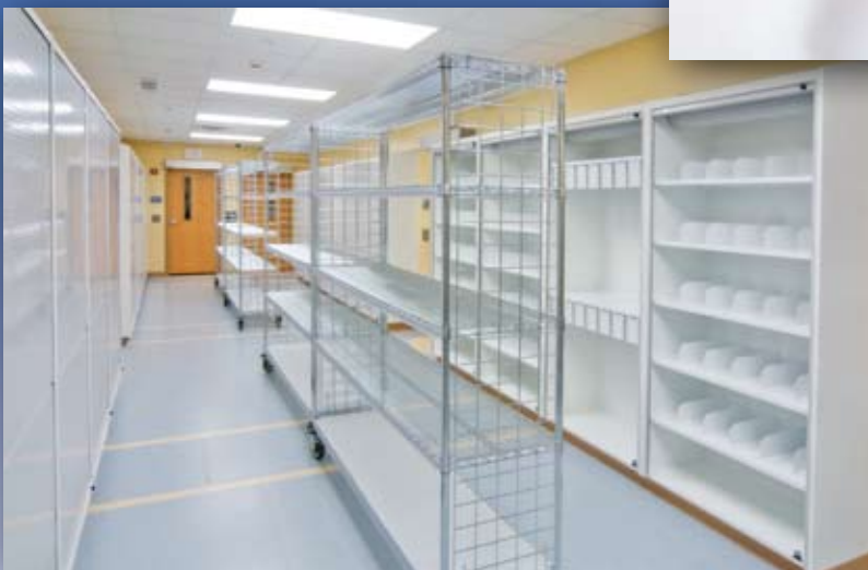
Clean Modular Storage Products