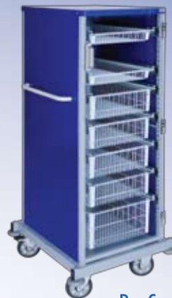
Par Carts Open & Enclosed