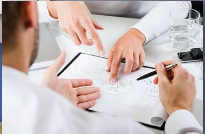
Expert Project Assistance from Start to Finish