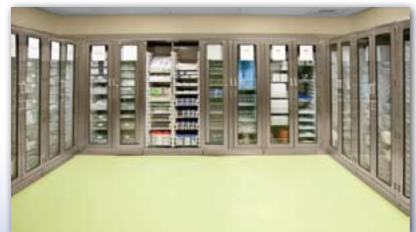
LogiCell® for enclosed storage