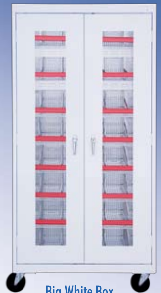
Big White Box