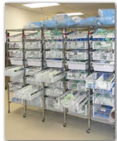
Par Stor®-III for high-density storage